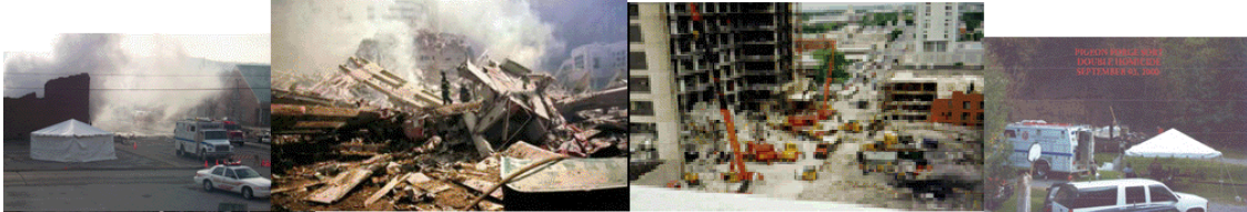
Federal Emergency Management Agency • United States Fire Administration Arson Intervention and Mitigation Strategy 2000 (Tennessee Project)